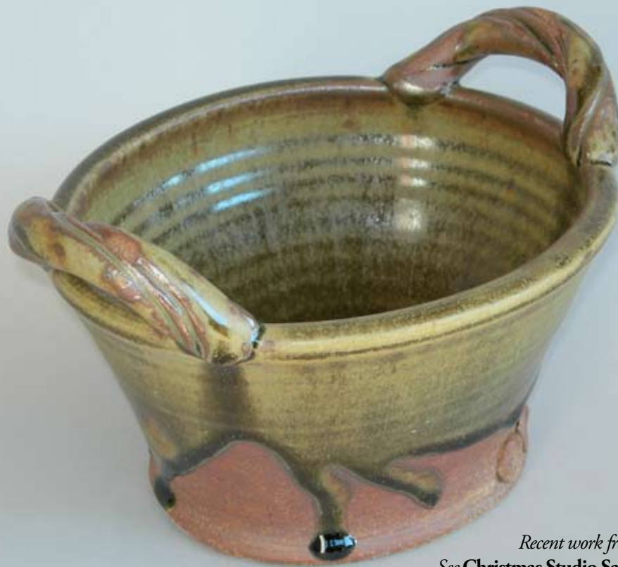
Recent work from Wildrice Studio. See Christmas Studio Sales listings, Page 10.