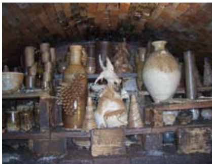
Tozan kiln opening.

engineers insisted that a one million B.T.U. after-burner be positioned at right angles in the flue half way up the hillside. I was part of the firing that had to be aborted when the melted flue bricks began flowing down towards the chambers!