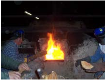
Nanaimo Tozan firing.

As you can see from the picture (below), pollution from the kiln became an increasing issue with the new highway directly above and encroaching housing development. At one point, environmental