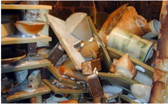
Melted alumina shelves in the Ombu kiln.