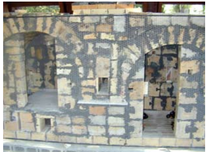
Building the Ombu kiln with used bricks from a cement factory.