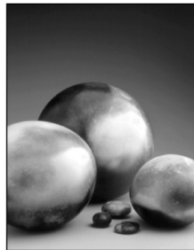
Ceramic stones by Jinny Whitehead