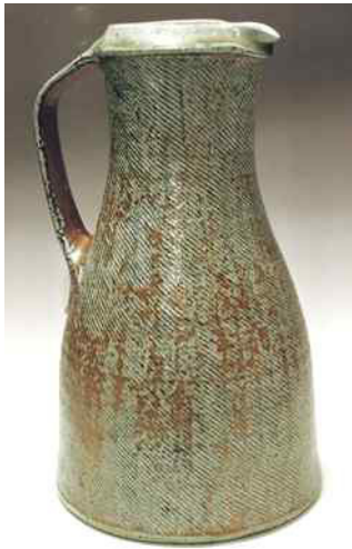
Tall jug, 15" high, salt glazed with impressed line pattern. Ash glaze over rim